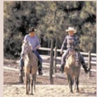
9. Hike, bike or horseback ride on miles of trails