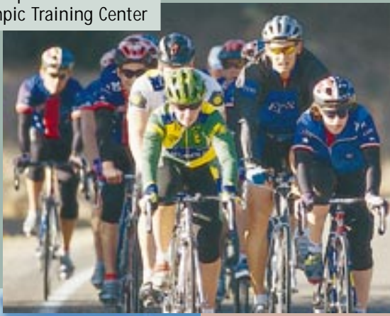
1. Watch top athletes at our U.S. Olympic Training Center