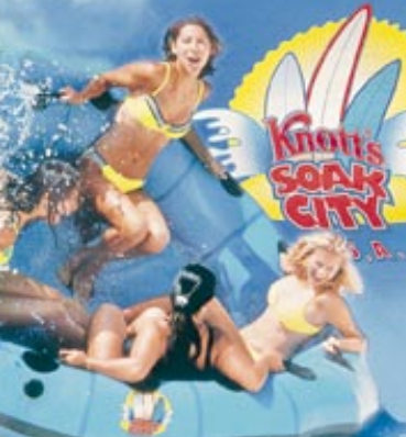
2. Catch the wave at all-new Knott's Soak City U.S.A.