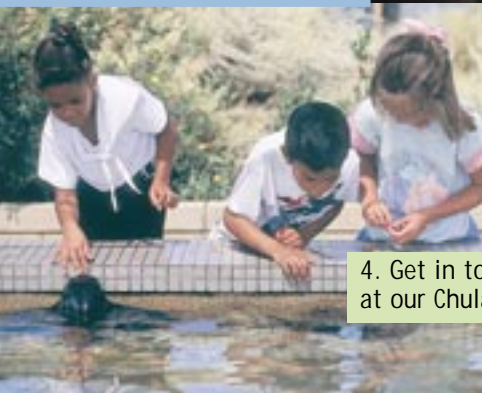
4. Get in touch with wildlife at our Chula Vista Nature Center