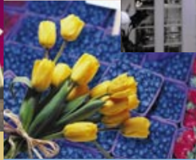
8. Find fruits and flowers at the downtown Farmers Market