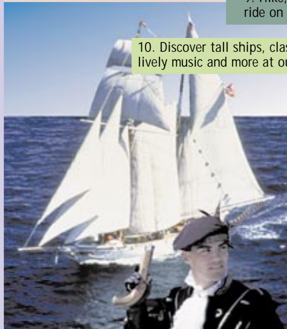
10. Discover tall ships, classic cars, lively music and more at our special events!