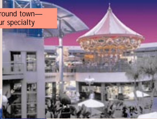
7. Browse around town—shops are our specialty